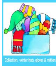
Collection: winter hats, gloves & mittens

Fall is upon us and a cold Kansas winter is just around the corner. October's monthly collection is hats and gloves which will be delivered to Let's Help for their clients. As I took hats and gloves there last October, the staff told me that they were completely out at that time. We all know Kansas weather is more than flexible, so let's see to it that children and families are not left out in the cold this winter. Let's Help always appreciates the support of St. Davidians.