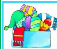
Collection: winter hats, gloves & mittens

Fall is upon us and a cold Kansas winter is just around the corner. October's monthly collection is hats and gloves which will be delivered to Let's Help for their clients. As I took hats and gloves there last October, the staff told me that they were completely out at that time. We all know Kansas weather is more than flexible, so let's see to it that children and families are not left out in the cold this winter. Let's Help always appreciates the support of St. Davidians.