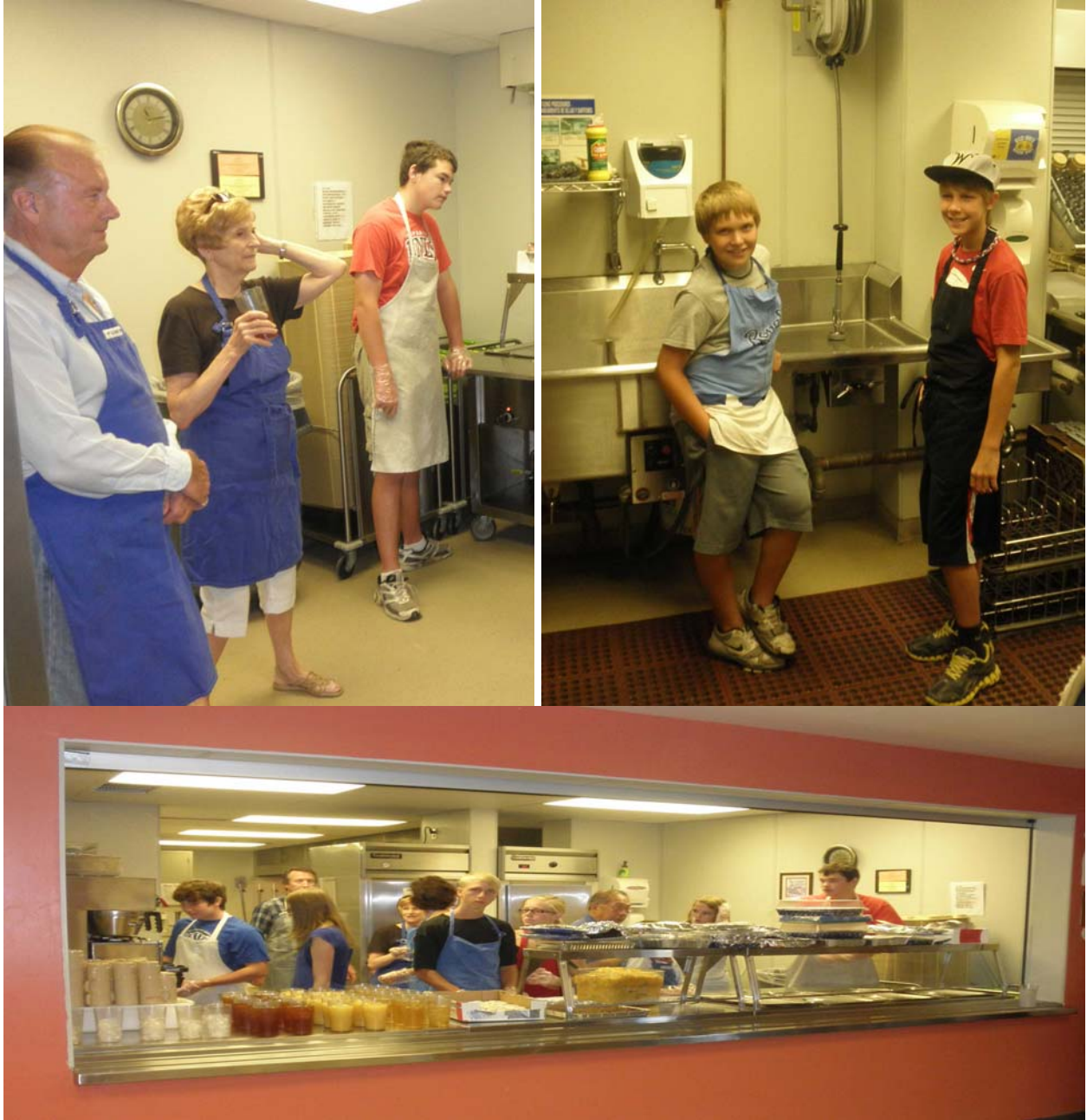
Scenes from youth helping at "Let's Help"