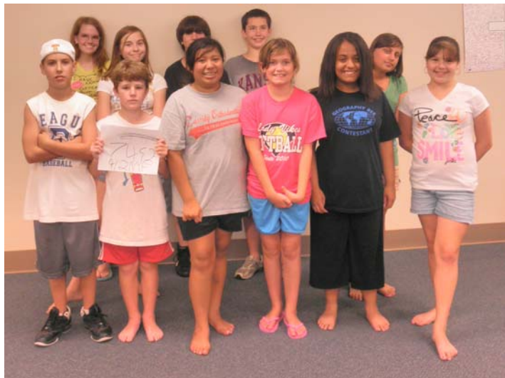
Junior High Youth Group at recent Lock-in. Who Needs Sleep?